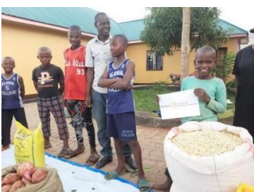
On 12<sup>th</sup> September we were visited by the District Governor who congratulated us on our team spirit and achievements. We were presented with a Rotary Azulejo especially for our Club.