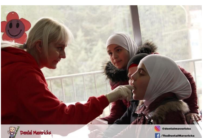
Dental Mavericks in the Bekaa Valley, Lebanon. <a href="https://www.dentalmavericks.org/our-work/lebanon/">https://www.dentalmavericks.org/our-work/lebanon/</a>

They treat 600-800 adults and children from poor communities per month; they run a fluoridation programme and an education programme for oral hygiene, including tooth brushing clubs. RCM-G donated 3000€ to support this work.