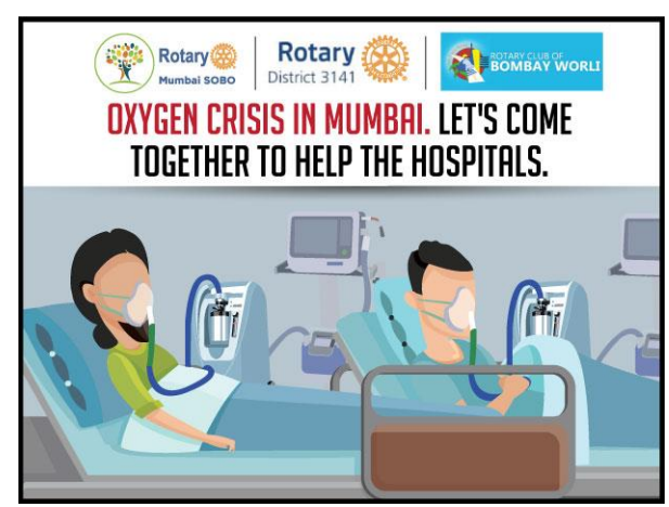
Oxygen Concentrator for India, with RC Mumbai SoBo