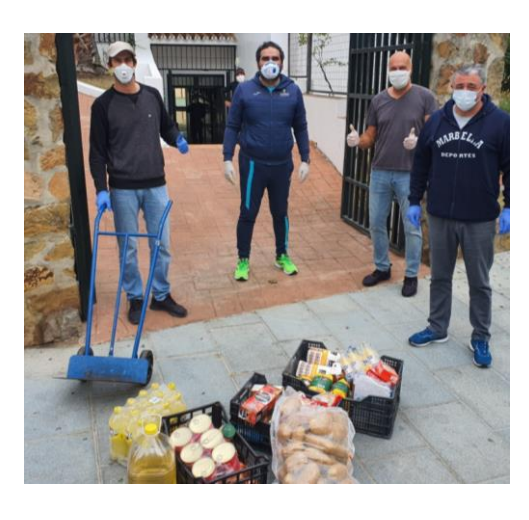
Food for 4 families in Marbella