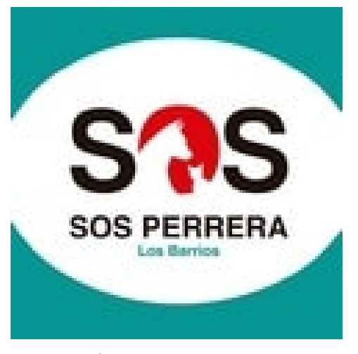
200 € for dog rescue